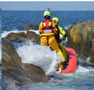
Access narrow and shallow areas